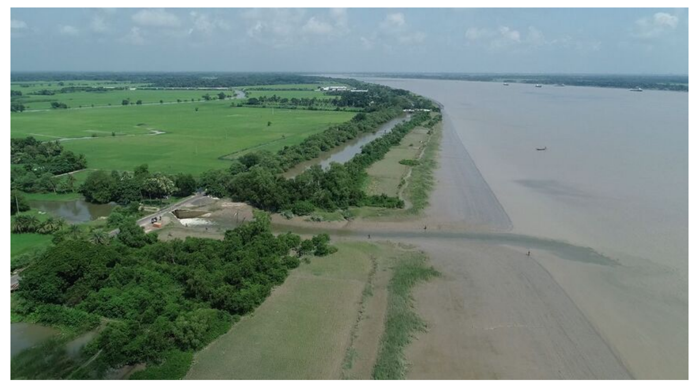
Photo C.1 A regulator draining excess water from Polder 31-part into the Kazibacha River