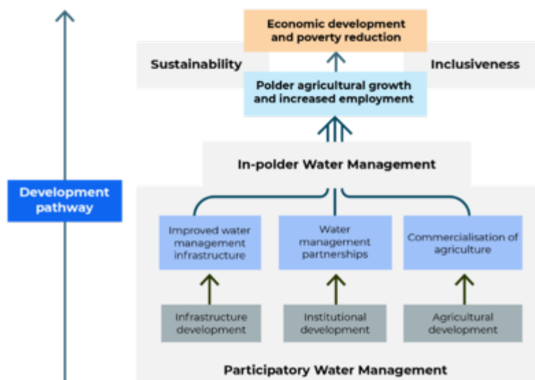
Figure E.1 BGP's simplified Theory of Change

This section focuses on BGP's agricultural development interventions which sought to enhance the commercialisation of agriculture. These interventions were to work in synergy with the rehabilitation of infrastructure and the development of water management partnerships. By enhancing both the productivity and profitability of agriculture and fisheries, polder agricultural growth brings both additional incomes and job opportunities.