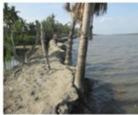
Figure-2: Continued Erosion in 2014

During this year erosion was getting worse. Local people appealed to the local MP and Minister for Fisheries & Livestocks, who gave them some hope of concrete block protection. As reported he also assured them that the fund was almost there and the work would be done soon. When Blue Gold Program became operational in April 2014, this issue was of primary importance to Blue Gold Program. Blue Gold had several meetings with WMGS, WMA and UPs regarding probable action that could be taken. Blue Gold proposed that since this program does not have provision for concrete block protection, it can go for a retired embankment at a sufficient setback distance (min. 100m). But the people were not ready to accept embankment retirement as they have already lost huge