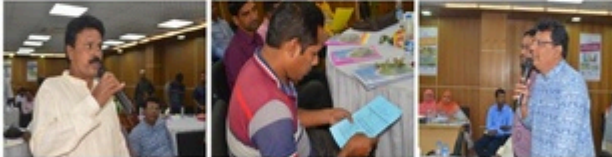
Shrimp Culture Demonstration Farm, Ellarchar, Satkhira October 17, 2019