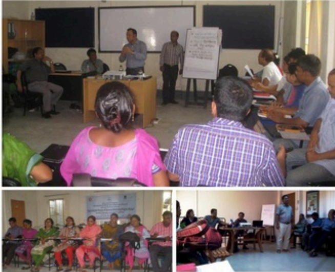
Khulna: Oct 3-4 & 5-6, 2016 Pattadakuli: Oct 17-18 & 19-20, 2016