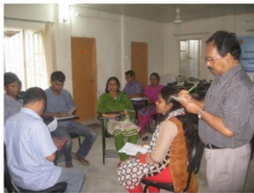
August 03, 2015 Patuakhali August 05, 2015 Khulna