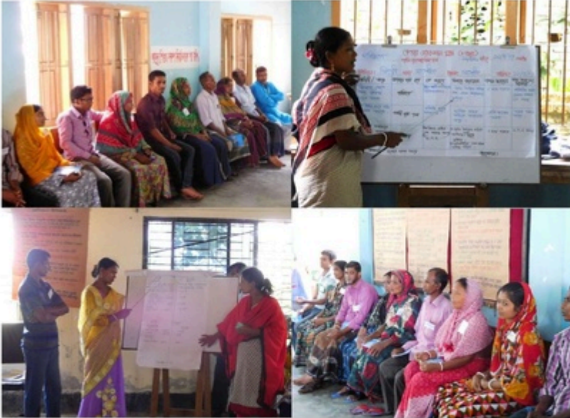
Picture: Pilot Training on Gender and Leadership Development in Progress