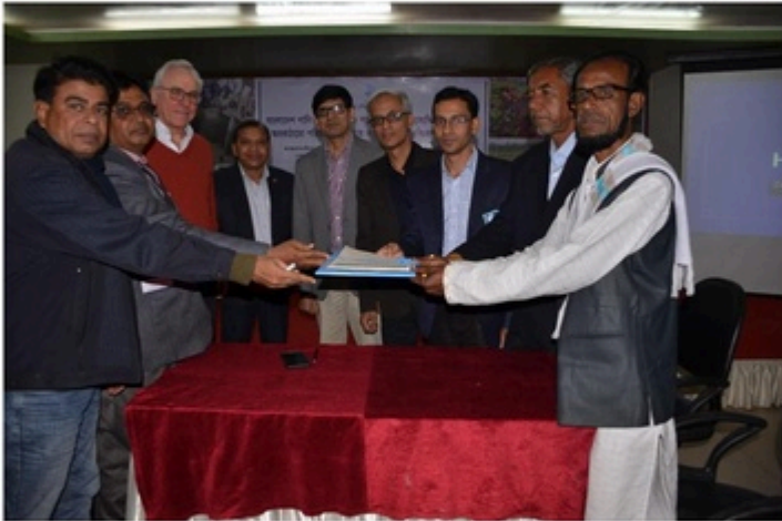
Upazilla Auditorium, Batiaghata, Khulna February 02, 2010