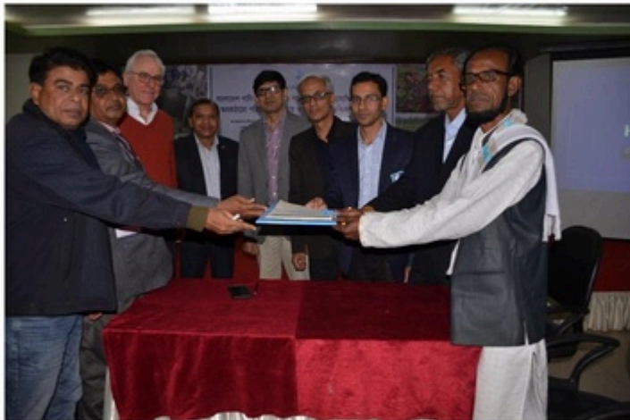
Upazilla Auditorium, Batiaghata, Khulna February 02, 2010