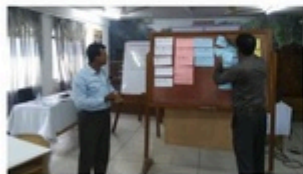
Blue Gold Program- DAE part and CAWM other FFS.