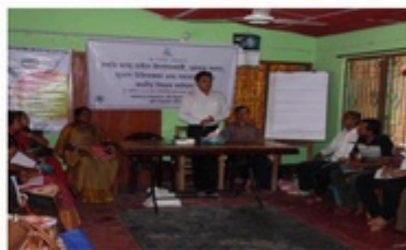
UAG of Dumuria in workshop

reasons on the other hand output market actors sometime says their business are not running well as per expectation. Polder 27/1, 27/2, 29 and 25 are mostly vegetables growing area and other polders in specific portion also grown well vegetables.