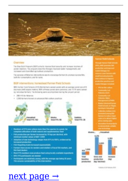
Size of this JPG preview of this PDF file: \underline{424 \times 599 \text{ pixels}} . Other resolution: \underline{170 \times 240 \text{ pixels}} .

Original file (1,240 × 1,753 pixels, file size: 9.37 MB, MIME type: application/pdf, 4 pages)