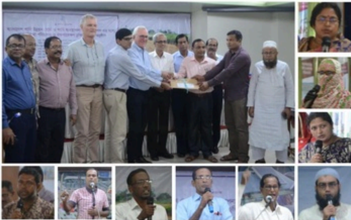
Ava Center, CSS, Khulna September 23, 2018