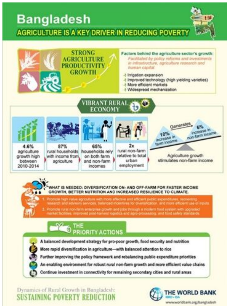
Figure 21.2 Infographic from World Bank Dynamics of Rural Growth in Bangladesh Report

The World Bank's Dynamics of rural growth and poverty reduction report of 2016 focused specifically on Bangladesh. It concluded that agricultural growth stimulates non-farm income, more specifically a 10% growth in farm income generates along a 6% increase in non-farm income , making agriculture a key driver in reducing rural poverty, see also Figure 21.2. Blue Gold's Working Paper 7 further elaborates how agriculture contributes to income, jobs and ultimately to poverty reduction.