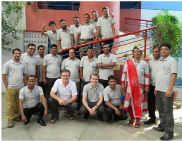
November 2015 Bangladesh Water Development Board Blue Gold Program