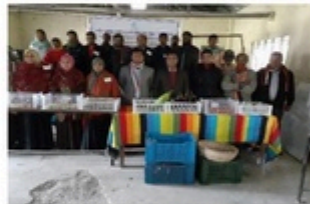
Figure 1: Participants in the training

Participants: A total of 49 Resource Farmer from four polder participated the training program. Of them 26 were Male and 23 were female Resource Farmers.