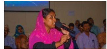
BGP case study women leadership v3.0 12 January 2020

In the 2016 UP elections, 25 women were elected in the Blue Gold area who had developed their leadership experience as WMG Executive Committee members.