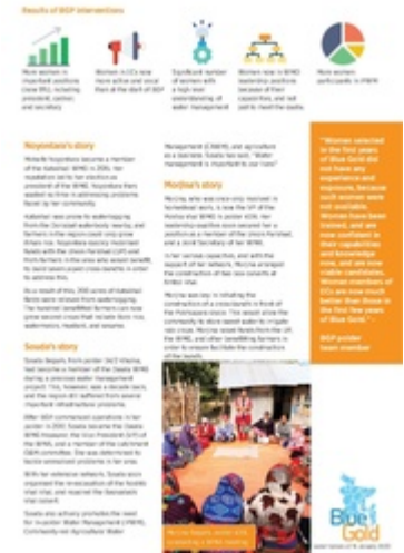
Case study: water heroes v2 16 January 2020

BGP staff encourage women in WMOs to speak out and take leadership