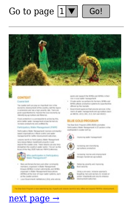
Size of this JPG preview of this PDF file: 424 \times 599 pixels. Other resolution: 170 \times 240 pixels.

Original file (1,240 × 1,753 pixels, file size: 6.43 MB, MIME type: application/pdf, 4 pages)