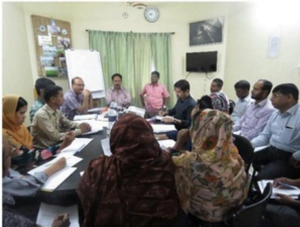
Satkhira Zonal Office, Satkhira

Date of the workshop: 23 - 24 April 2019 Date of Workshop Review: 25 April 2019