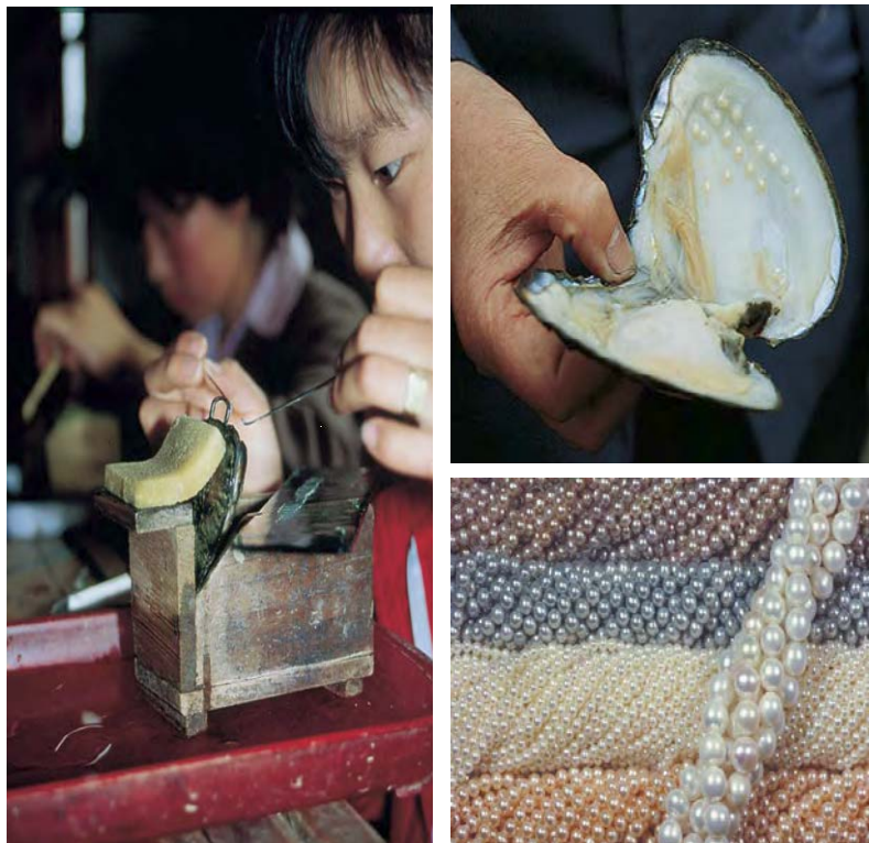
Figure 3. Left: the tissue nucleation technique involving operating a small square strips of mantle tissue into the mantle of a mussel. Right: yield of seed pearls (<4mm) in a C. plicata mussel in China.

One mussel can bear over a dozen grafted pieces, these will result in pearls (Figure 3) (Scarratt, Moses et al. 2000). The pearls can be harvested after two to three years of the initial operation depending on the desired size and quality (FAO 1986). After the pearls are harvested the mussel can be re-grafted up to about 4 or 5 times (especially mussels that produce good quality pearls) producing larger pearls each time, due to the growth and expansion of the original pearl sacks. Pearl mussels can be cultured in ponds, portions of lakes, rivers, irrigation canals or dams. A pond, as a culture site, will have an advantage as water quantity and quality can be controlled. Seven species of pearl mussels from two genera were identified from freshwater bodies of Bangladesh (Pagcatipunan 1984), these species are ( Lamellidens marginalis and L. jenkinsianus var. obesus , Perreysia daccaensis , P. wynegungaensis , P. (Radiatula) pachysoma , P. favidens var. assamensis and P. favidens var. deltae ). The species Lamellidens marginalis is best fit for culturing because of its larger size and common existence in inland water bodies (FAO 1986).