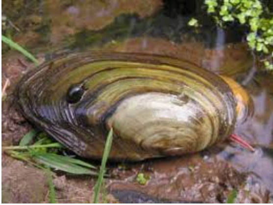
Figure 2. Pearl bearing wild mussel of Bangladesh.