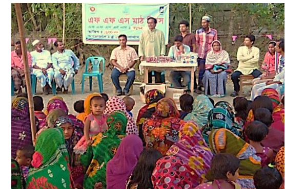
Chairman of Kukua UP is delivering his views on importance of FFS in a FFD

To arrange formal hand over of FFS to concern WMG along with a completion report