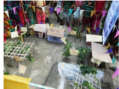
a. Homestead Activities Booth - Prepared a model of homestead with showing main house, kitchen house, cow-shed, poultry-shed, Homestead Activities Booth latrine, tube-well, ponds with dyke vegetables. Demonstrated earlier practiced vegetables plot (no

In the FFS Field Day, the FFS members & Concern FOs pair prepared 4 booths on the basis of FFS curriculum and learning session. During the FFD, it was seemed to be a festival in the community especially among the kids & young. Different stakeholders from the community along with WMG EC people have attended in the FFD. FFS-wise date, location, attendance of the FFD is given in the annexure-1. The booths those have been prepared in the FFD are given below -