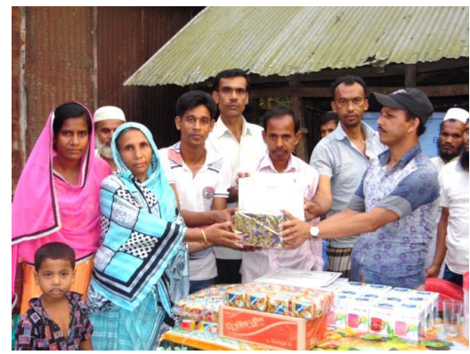
One WMG Secretary along with others is distributing Prize & Certificate to the FFS

Next activity of FFD was Certificate & Prize distribution. From the very beginning to the end of FFS, FO assess each and every FFS members on their activities like timely attendance, regularity, FFS suggestions followed, communication & liaison with Upazila line departments as well as with BGP, efforts for horizontal learning, above all, their performance and selected 3 persons from each of FFS group -1^{\rm st} , 2^{\rm nd} and 3^{\rm rd} . This initiative has created more attention & interest of the community people to work at homestead. The certificate was for all FFS members as the recognition her/his participation in the Farmer Field School and successful completion of all sessions of the FFS organized by Blue Gold Program. The