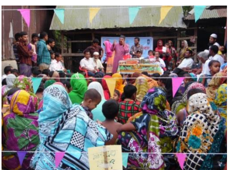
One WMG Executive member is sharing his idea and cherishing FFS activities in the FFD

All EC members of WMG were invited to join in the FFD and WMG President and or Secretary including other executive members attended in every FFD. They highly appreciated the FFS activities of the Blue Gold Program. They cited some example by mentioning name of some farmers whose livelihood had been changed by joining with Farmer Field School. They appreciated activities of the FOs, their labour and their efforts to make the FFS successful. Some WMG ensured that they would take care of the FFS to continue its activities. They urged to all participants of FFD to continue the knowledge/learning they had from the FFS. WMG people also requested to concern FO to convey their wish, for