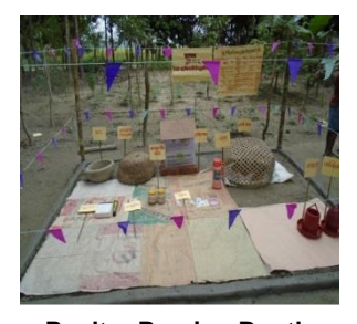
Poultry Rearing Booth

adolescent & lactating-mother; hygiene, sanitation & safe water; importance of hand-wash and importance of 1000 days care for mother & child etc. Demonstrated improved cooking process (i.e. process how to maintained food nutrients). Shown different