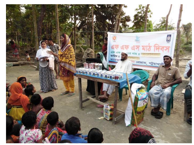
One female FFS member are sharing her learning and experiences in the FFD

In maximum cases, FFS participants informed that earlier they did not grow vegetables in bed; they had learnt benefits and importance of beds in growing vegetables from the FFS sessions. They had no experiences for growing Carrot & "Bati Shak" and even