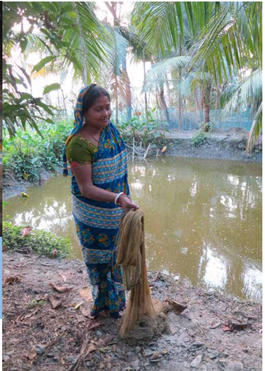
From above clockwise: Women store seed for the next rice crop; empowerment of women to lead in homestead aquaculture; school children in polder 43/2; farmer standing on sluice gate, the river behind him at high tide.