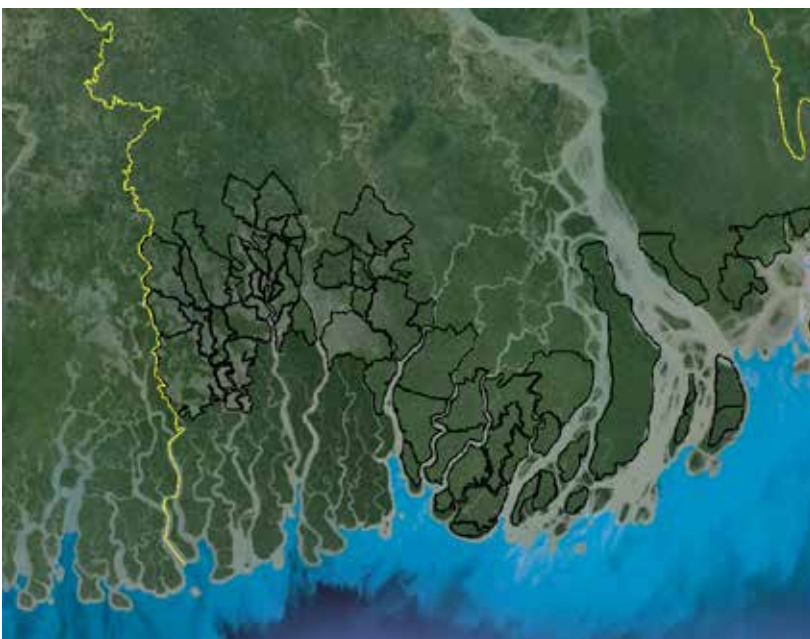
The polders (delineated in black) of the coastal zone of south-west and south-central Bangladesh.

Large-scale coordinated development of well-engineered embankments and the creation of polders in the coastal zone only began in the 1960s with the implementation of the Coastal Embankment Project (CEP), driven by the need for land and food for the increasing population. The polders were designed to increase agricultural production by protecting the lands from inundation due to high tides and river flooding, but they also provide protection against typical storm surges. Polders, ranging in size from a few thousand to about fifty thousand hectares were constructed throughout most of the coastal zone, with foreign aid assistance. Sluice gates were installed in the embankments, with most gates connecting some of the larger natural channels within each polder to the surrounding rivers. This provided the ability to drain water from or bring water into the polders as needed, and additional smaller inlet structures