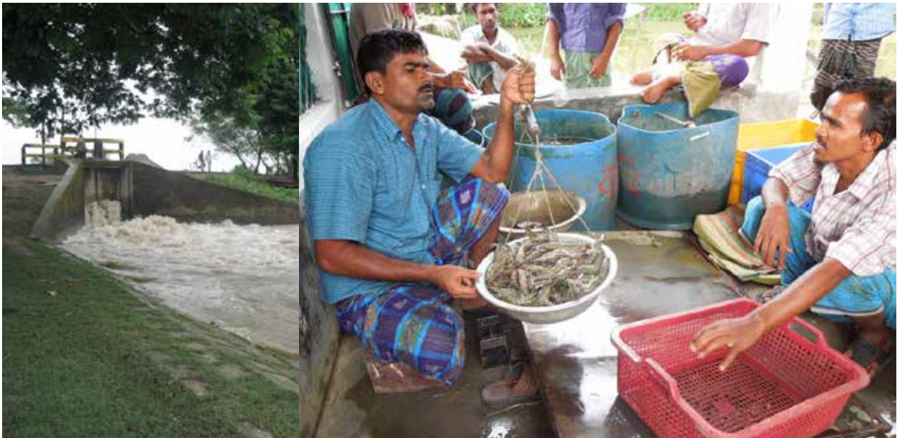
Sluice gate in a polder embankment letting water into the khal for irrigation