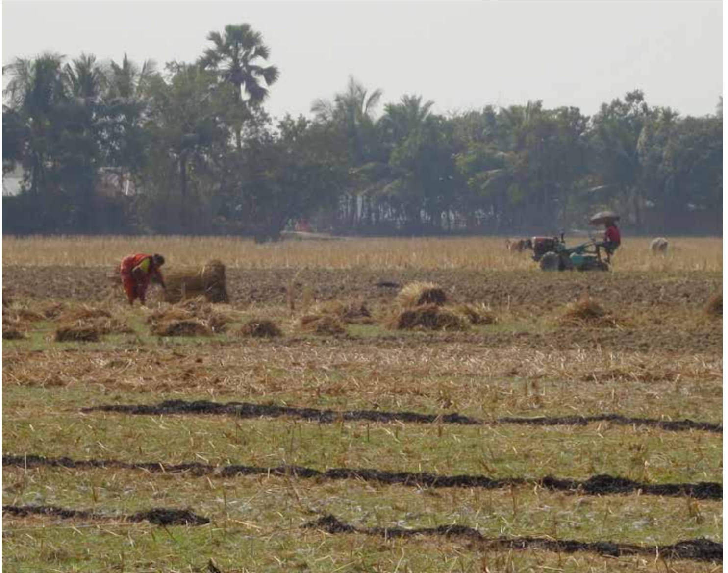
It's mid-February on polder 30, and most of the land is still fallow; women collecting last year's rice straw for fuel, ploughing for sesame beginning