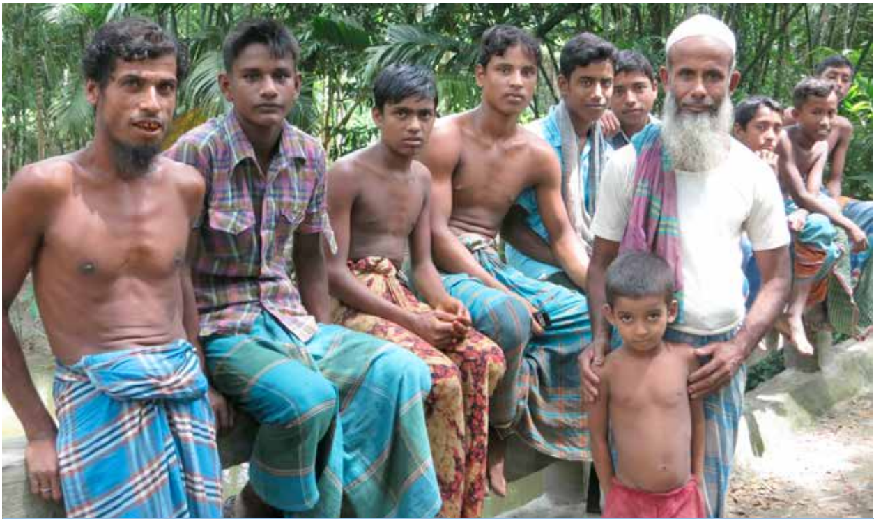
Farmers at Bazar Khali in polder 43/2F.

The CGIAR Challenge Program on Water and Food (CPWF) Ganges Basin Development Challenge (GBDC) b [10] research shows that with existing advances [11] in crop and aquaculture technologies and available water resources [12], there are tremendous opportunities [13] to improve food security and livelihoods in the coastal zone. Furthermore, given the pressure to increase production further to meet the needs of the growing population of Bangladesh, and the already high cropping intensity and production in other parts of the country, the coastal zone may well be the only region where significant gains can still be made. This opportunity for the polders is also an opportunity and priority for Bangladesh.