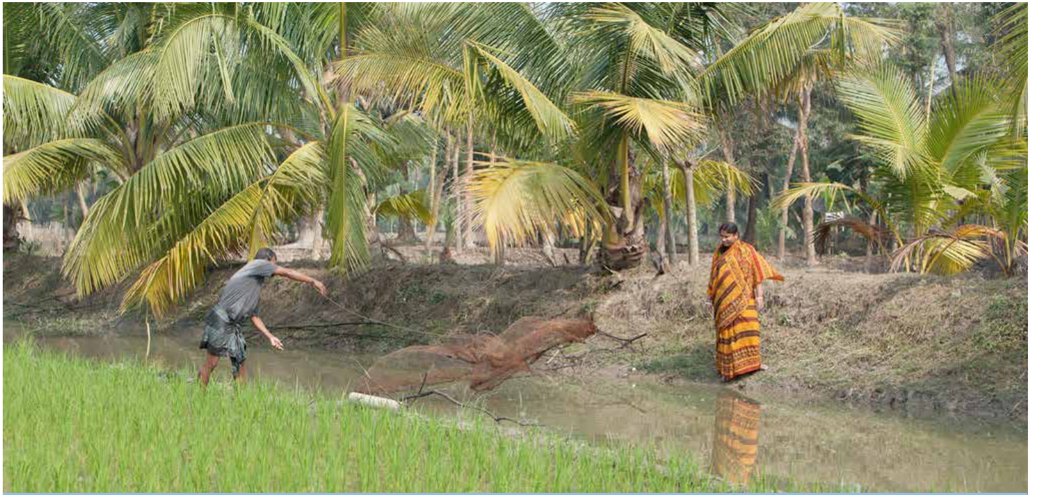
Fishing in a rice-fish system in a low salinity region