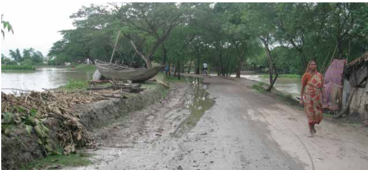
Polder embankment protecting the lands inside the polder (right) from flooding by the river at high tide (left).

Yet, despite the huge investment in the coastal zone to date, the poverty of farming families in the polders remains extreme. For example, about 80% of rural households in the polders of the south-west and south-central coastal zone exist on less than the national poverty line (US$1.25/person/day) compared with the Bangladesh national average of 40% [9] . More than 50% of rural households are functionally landless, with less than 0.2 ha per household [9] . Much of the poverty has been attributed to soil and water salinity, and to flooding as a result of rainfall and drainage congestion, that constrain agricultural and aquacultural productivity and cropping system intensification. Only 25% of the cropped land area is irrigated compared with the national average of 68% [2] .