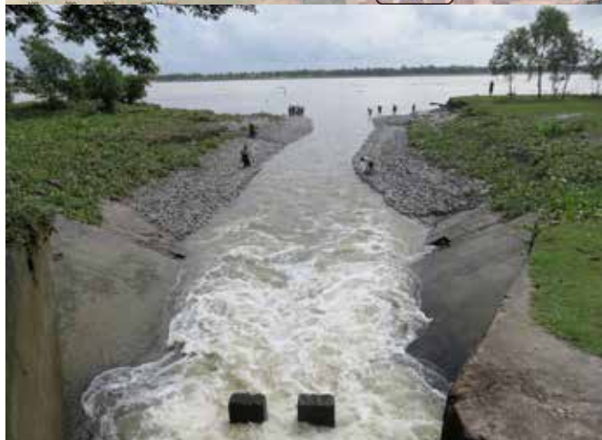
Above left: Local government and village roads bind three sides of this six hectare water management unit.