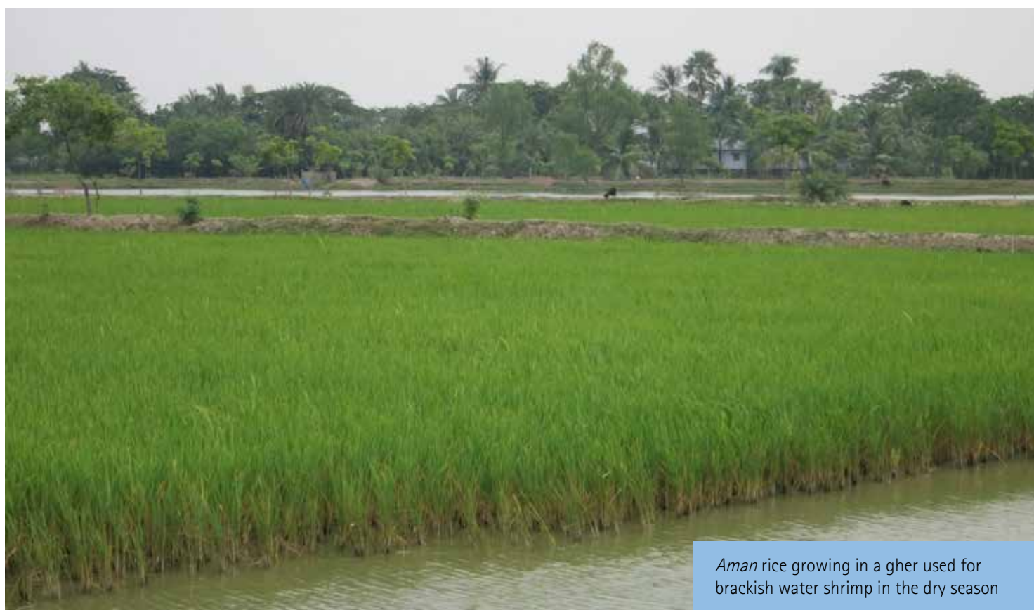
Aman rice growing in a gher used for brackish water shrimp in the dry season