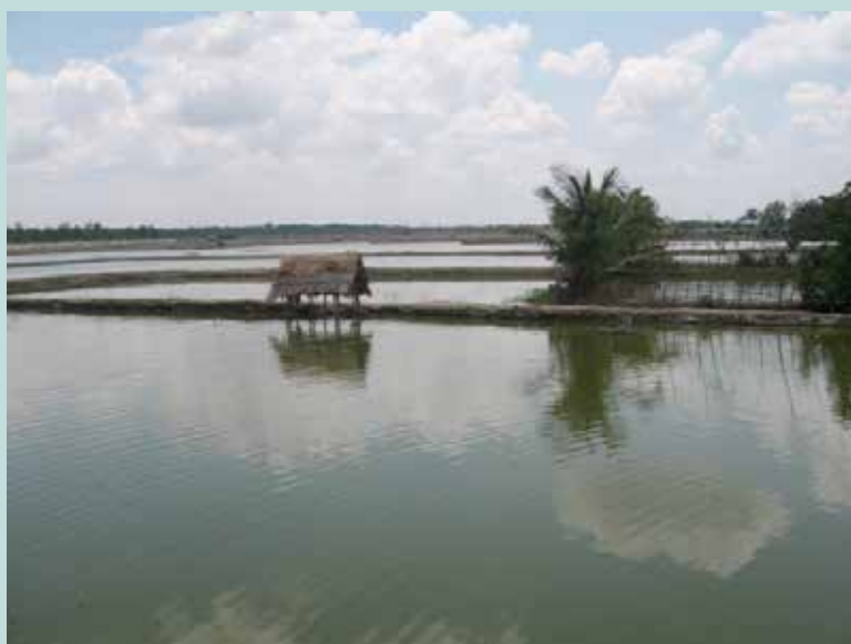
Above: Shrimp ghers during the dry season in polder 3

Front cover photo: A typical scene in the rainy season - farmers transplanting old seedlings of traditional rice varieties, with water level above their knees