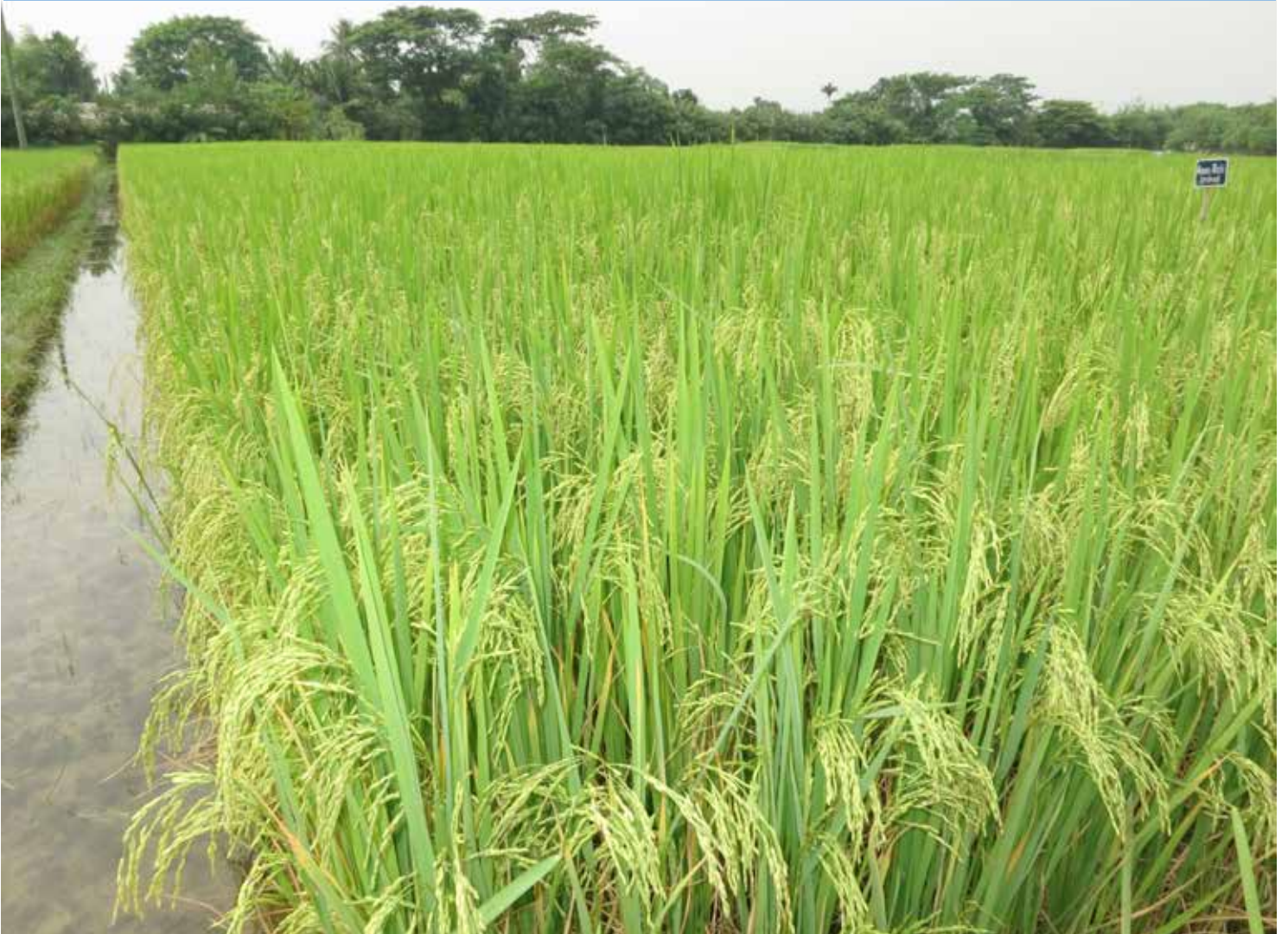
Aman rice (high yielding variety, HYV) in polder 30.