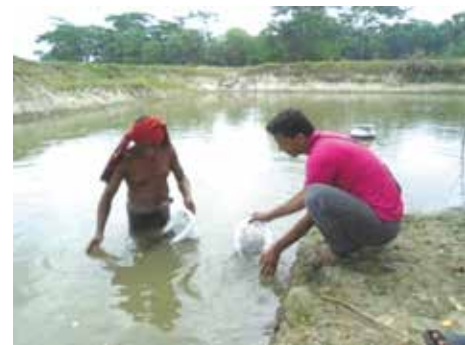
Farmer releasing fingerlings in trial pond