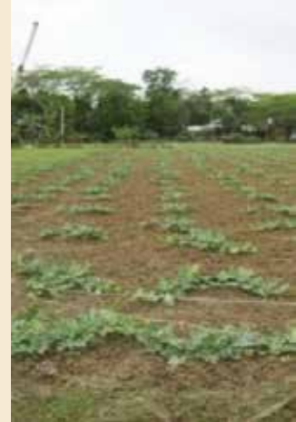
Good production of watermelon

CAWM farmers participated actively in improving field channels and in operating the Amkhola sluice to protect their land from waterlogging. As a result, the production of Watermelon, Sunflower, Sweet potato and Pumpkin was not affected in the CAWM areas. However, it estimated that 10-15% production of the Mung bean BARI-6 was damaged due to waterlogging while 80% production of local Mung bean, chili, sweet potato, and Cowpea was damaged in the non-CAWM areas.