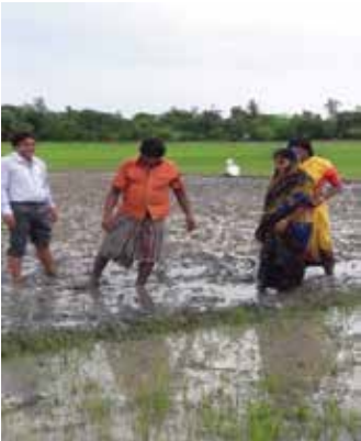
Members of CAWM are working in the polder 2