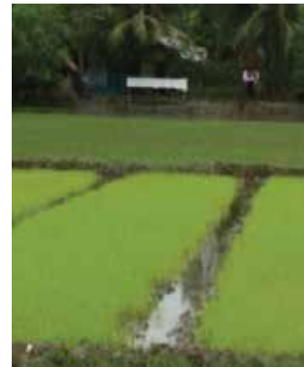
Good Rabi crop production in the polder 2

Polder 22: The harvest of Sesame was hampered in both the CAWM and non-CAWM areas due to waterlogging resulted from heavy rainfall. However, improved field channels and proper management of the Gopipagla outlet ensured the expected yield from Sunflower and Mung bean production whereas 60-70% of the Mung bean production was damaged non-CAWM areas.