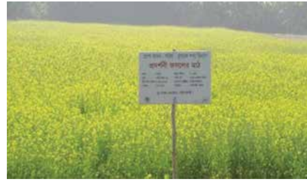
Mustard field at Polder 43/2F

The comparatively short duration rice variety BRR1 Dhan 52 allowed harvesting some 35 days earlier than traditional varieties. Participating farmers were encouraged to change also their traditional harvesting practice to consider the cultivation of Mustard. The idea of growing Mustard in the area was not new but evolved from Blue Gold – DAE collaboration as DAE has been undertaking Mustard demonstrations in the area before. A critical innovation was the selection of short duration Mustard varieties, which in combination with the short duration rice, would allow also Mung bean to be grown in a T-Aman-Mustard-Mung cropping system.