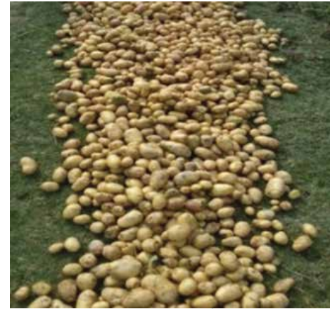
Good production of potato in polder 43/1A

In this polder, most of the farmers cultivated Watermelon in last Rabi season. In CAWM areas, the damage of Watermelon was estimated around 25-30% while outside of the CAWM areas, it was more than double (60-70%). Though there were field channels and dykes in the CAWM areas, drainage structure (very old outlet) was out of order. So, heavy rainfall led waterlogging in these areas. However, the CAWM farmers took initiatives to pump out water from the field channels to outfall river that resulted in less damage of watermelon compared to non-CAWM areas.