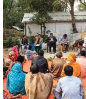
Members of the CAWM group in the polder 31 part

CAWM Lesson Dissemination: CAWM-WMGs introduced Horizontal Learning to scale up CAWM in the BGP Polders during November- December 2016. Through Experience sharing visits for horizontal learning about 330 representatives of different WMGs visited the 10 CAWM pilot areas. The host CAWM farmers explained what they learnt through CAWM-FFS, e.g. effectiveness of field channels, small dykes around plots, maintenance of infrastructures including branch khals and overall internal water management. Observing the water management practices and achievements in crop production of the host CAWM (WMG), the visitors were inspired and encouraged to undertake similar initiatives in their own areas; inspiration and enthusiasm were also generated from the workshop on planning of Rabi crop cultivation (with DAE initiative). Besides, the farmers of neighbouring areas/WMGs are also taking lessons from practices in CAWM areas and practicing these in their own areas.