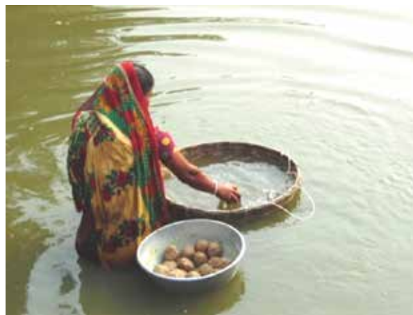
Applying of mixed feed in trial pond

Blue Gold supports communities in becoming a driving force for using existing natural resources, such as ponds and public water bodies. In close collaboration with the Department of Fisheries, technical assistance is provided to polder inhabitants, including assistance in identifying, testing, learning, and replicating innovations. By establishing linkages among the polder inhabitants, the government agencies and private sector actors, the institutional framework for future development is established.