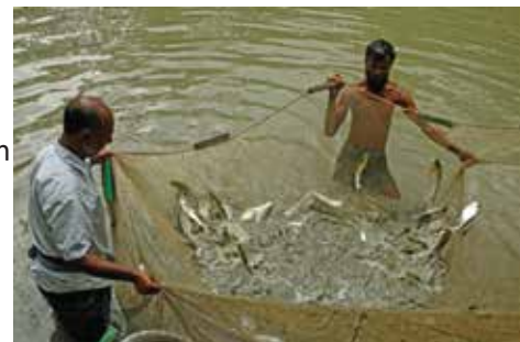
Harvesting of fish for sampling period