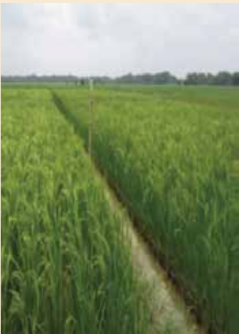
Field channel in polder 43/2B