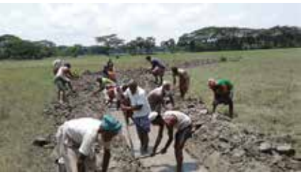
Excavating field channel in polder 43/2A