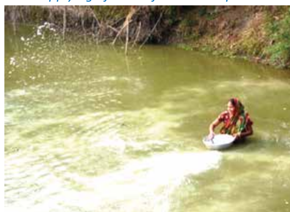
Application of lime in trial pond

Blue Gold (fisheries & livestock part) has conducted 88 FFS (April to Mid-December 2016) with a combined module of fisheries, livestock and nutrition) in the 3 divisional districts with proper liaison with the DoF and the DLS, mainly the Upazila and district level fisheries officers were involved. BGP has given more priority to the poor WMG members to involve in the FFS activities. A total of 88 trial ponds were established for 88 FFS in 88 WMGs of 3 districts -Khulna, Sathkhira, and Patuakhali- for “learning by doing” for the participants.