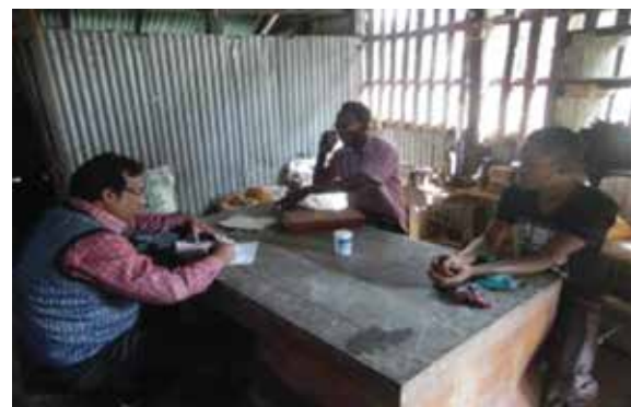
Information collection from output actors

BRRI Dhan 52 was generally favoured by the farmers due to its high yield, while earlier harvesting led them to recognise benefits in terms of food security, loan repayments, livestock feeding and savings on labour.