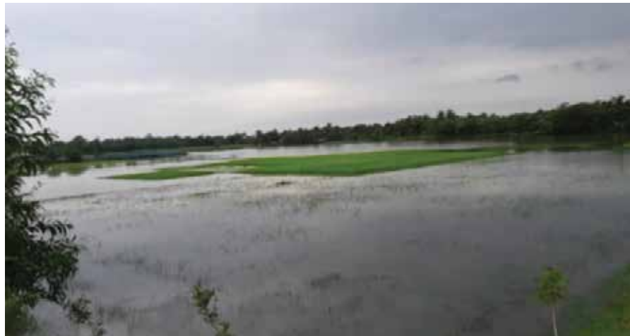
Water logging in the polder 31 part due to heavy rain

During the last Rabi season, farmers used pumps for irrigation for the first time in the CAWM areas. They also improved the field channels and constructed small dykes around their plots for improved on-farm water management. The technical experts of BGP estimated that 50% of the CAWM farmers' sesame was damaged while the around 100% of non-CAWM farmers were not able to get any return from their sesame cultivation.