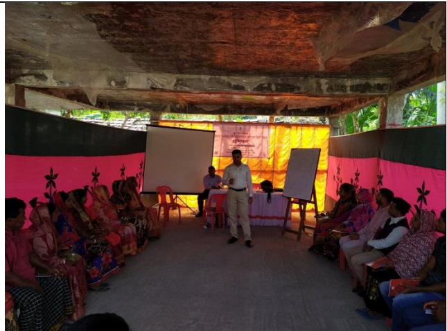
Facilitating by ULO Satkhira Sadar