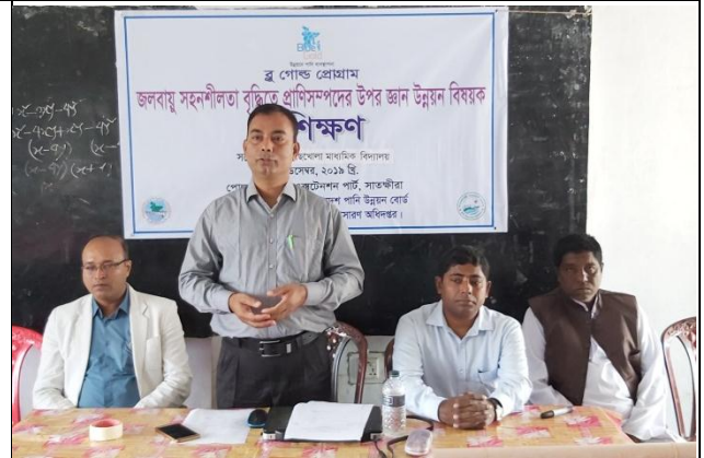
DLO Satkhira in the training facilitation