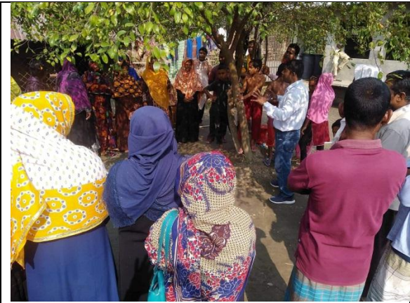
Practical in Field