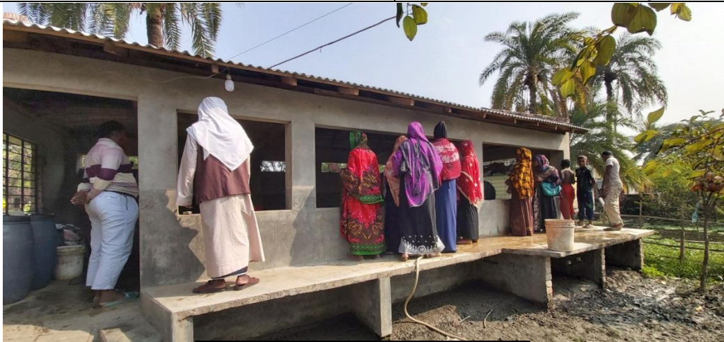
Field visit by participants